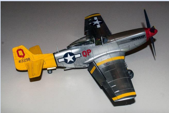
North American P-51D Meng Models Alclad Metal paint, Tamiya Acrylics and Aeromaster decals