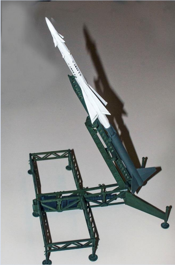
Nike Ajax Missile Renwal Approximately 1/40 th scale ( box scale) Revell re-issue