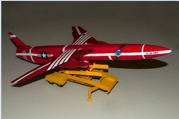
Northrop SM-62 SNARK 1/48 th Scale Lindburg reissue (J Lloyd International) This is a BIG missile! Most of the work is spent on the launching platform.