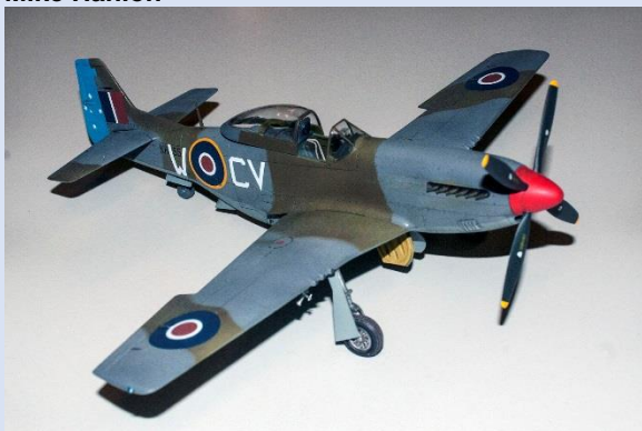
North American P-51D Mustang, Tamiya Ultracast Aeroproducts propeller, Decals by Xtradecals. Camouflaged and markings for Mustang Mk.IVA, KH755/CV-W, "Anita" of No.3 (RAAF) Squadron, Cervia, Italy, April-May 1945.