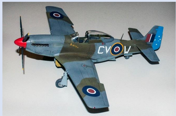
Painted in Firewall camouflage scheme. Gunze and Tamiya paints. Underside Tamiya XF-83 Medium Sea Gray Upper camouflage Tamiya XF-24 Dark Gray Gunze Sangyo H-51 Olive Drab {1} Flory water soluble dark wash