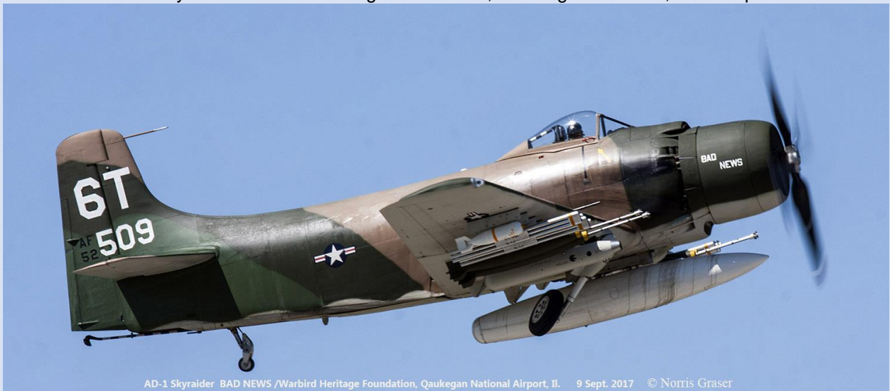
AD-1 Skyraider BAD NEWS /Warbird Heritage Foundation, Qaukegan National Airport, Il. 9 Sept. 2017

AD-1 Skyraider Warbird Heritage Foundation, Waukegan Nat.A.P., Il. 07 Sept 18