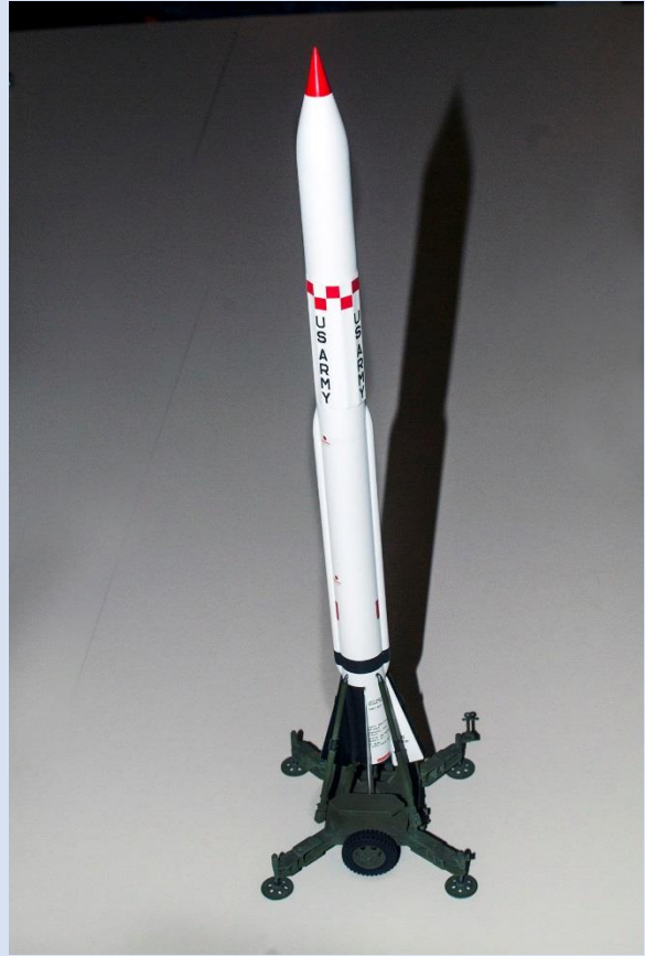
Corporal Missile 1/35 th scale Revell